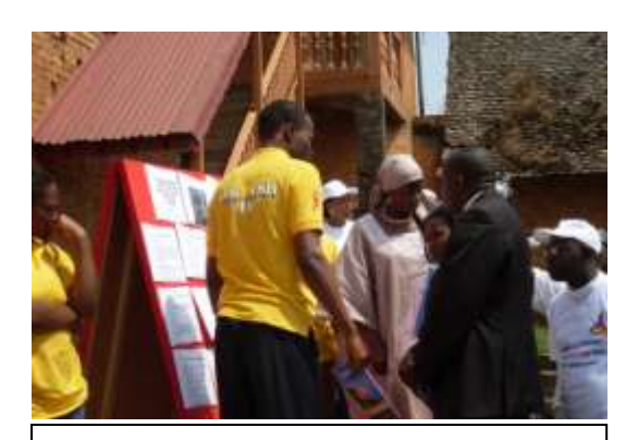
Representative of Governor and entourage listening to the presentation of SIDA COOP