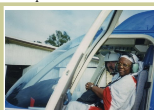
Furu Awa (one of the villages) was so remote IDF needed to take a helicopter