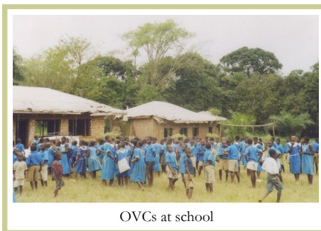
OVCs at school

Through the provision of care and support to OVCs and their caregivers, families were encouraged to accept children who had lost their parents, and acceptance of HIV and AIDS was instilled in some people.