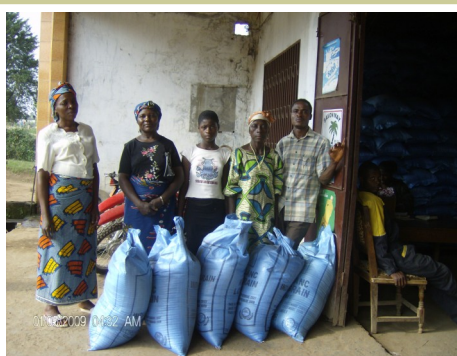
Rice being distributed to OVCs and their families in Wum

Project Context: The HIV and AIDS pandemic has had many negative impacts on the North West region, one of the most significant impacts is the increased number of orphans and vulnerable children. The government provided care and support to these children until 2009 when funding was significantly reduced. In an effort to ensure the continued wellbeing of these children, CARE Cameroon with technical assistance from IDF (responsible to coordinate the deliveries) decided to provide Educational, Nutritional and Hygienic support to 430 OVC in Wum Central, Fungom, and Menchum valley selected using laid down criteria.