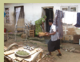
Volunteers helping clean the homes of people living with HIV

Results and Impacts: IDF consistently gets positive feedback on its World AIDS day activities from its staff, its community volunteers, the regional technical group and beneficiaries. IDF distributes condoms and brochures to ensure that the information about HIV and AIDS as well as IDF and its programs is spread to the community.