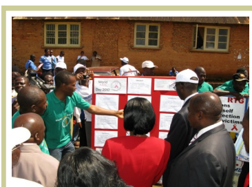
IDF Information Stand with the Governor

Project Context: Started on 1 st December 1988, World AIDS Day is about raising money, increasing awareness, fighting prejudice and improving education. World AIDS Day is important in reminding people that HIV has not gone away, and that there are many things still to be done.