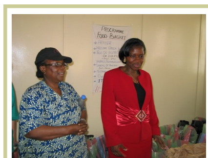
RTG director visiting the 2010 food basket delivery ceremony