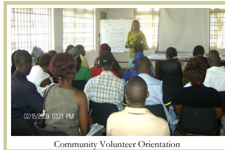
Community Volunteer Orientation

Given that the initial HBC program area of intervention was too large to be manageable, IDF carried out a mapping exercise to set a new area of intervention. In addition to setting the area of intervention, IDF also identified the relevant clients by going through client files from 2004 to 2008 at the Day Hospital and sorting out all the clients by quarter within IDF's area of intervention. This helped to determine the concentration of clients per quarter.