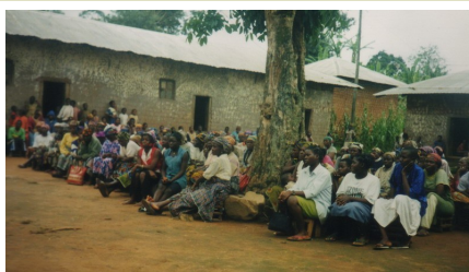
Raising awareness in villages about HIV/AIDS

Description: IDF in partner with GTZ, and DED carried out awareness campaigns and trainings with communities and teachers in various localities in the North West Region.