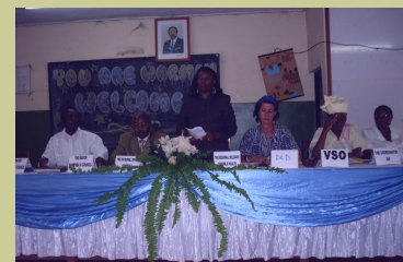
Officials at Swearing in Ceremony

The Regional Delegate of Public Health praised IDF's work and initiative by saying "[IDF and its staff] are not only performant, they have stood the test of time and they have values of sustainability...If I had money I will pump into IDF. It is an opportunity and the right place for this to start and we have to throw our weight on this project. As the old doors are closing this is one of the new doors opening and we should be able to get in through it. And that if we focus on it, it will produce results that will serve into scaling up. I see it going very far, not only at the level of Bamenda, regional level, national level but even at the international level".