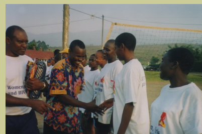
Volleyball game with the military in Bamenda to raise awareness about HIV and AIDS