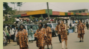
World AIDS day in 2004