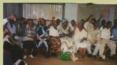
Raising awareness with villages