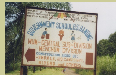
Visiting schools in Wum and supporting OVCs

In 2010, OVCs were identified as a target group in the five year partnership agreement that was signed between IDF and VSO.