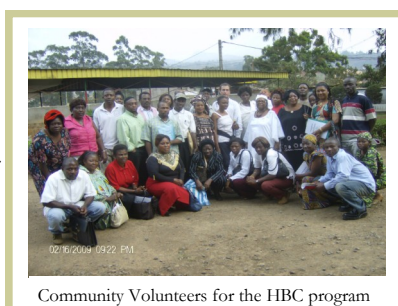
Community Volunteers for the HBC program

Project Context: After her experience with the initial HBC program developed by the government, IDF proposed a new system to address some of the difficulties that existed in the old system. Given that the role of a HBC program is to build a link between the community and Health Services, IDF's proposed system involved the community substantially. CVs were chosen within the quarters in the area of intervention and were paired with clients in those quarters to facilitate the ease of carrying out home visits. CRAs continued working both at the treatment centres and in the community but focused predominantly on improving the services at the treatment centres.