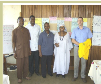
VSO Country Director Visits IDF

In March 2010, the VSO Country Director visited IDF in order to learn more about IDF and its programs and to discuss issues facing IDF in the context of its work. This meeting was highly productive and left the new country director feeling more informed about IDF's work. IDF hopes to have more opportunities to meet with VSO's country director.