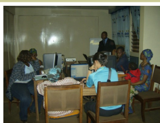
Epi Info Training at IDF