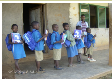
OVCs collecting educational support items