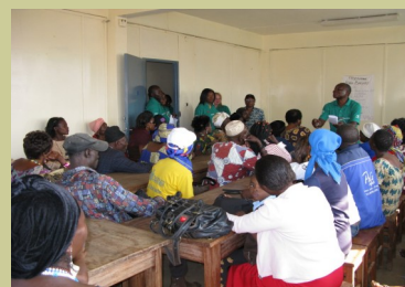
IDF staff speaking at the 2010 Food Basket Distribution