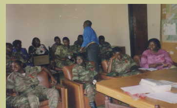
Ensuring that the military is aware about HIV/AIDS