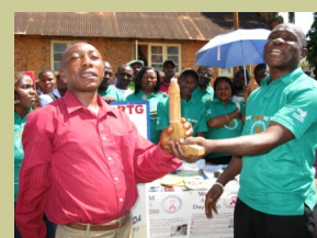
Condom demonstrations on World AIDS Day