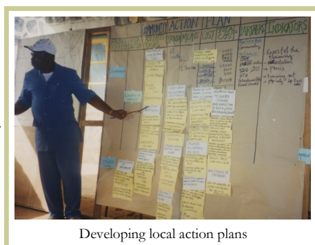
Developing local action plans