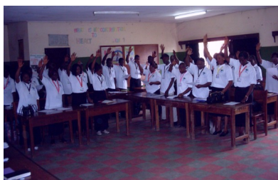
Swearing In Ceremony with CVs

In order to ensure that the quality of activities are consistent between and across CVs and clients, as well as to ensure that the objectives of the program are being met, IDF developed a monitoring and evaluation system with the support of VSO. This system ensures that the CVs record their activities and their impacts with their clients, thereby providing data for concrete analysis of the program impacts.