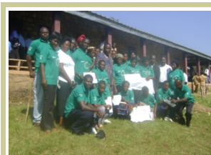
IDF Volunteers in Wum