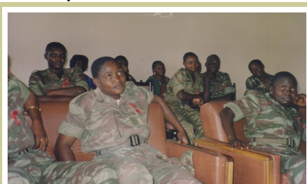
The female military learns about HIV and AIDS

Project Context: Women are generally more vulnerable to HIV and AIDS and often the female population has a higher prevalence rate. Biologically women are twice more likely to become infected with HIV through unprotected intercourse than men. In many countries women are less likely to be able to negotiate condom use and are more likely to be subjected to non-consensual sex. Women are put further at risk due to factors such as female genital mutilation, sexual harassment, violence against women and a lack of financial autonomy.