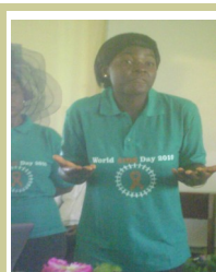
18 year old OVC in Wum testifying about being a virgin