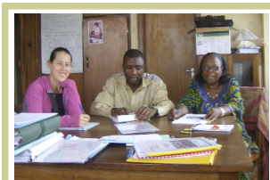
Visit with VSO's HIV and AIDS Programme Officer

In November 2010, IDF and the new Programme Development Officer (PDO) for the HIV and AIDS Programme in VSO met to discuss the way forward in the 5 year partnership. This meeting served as not only an informal introduction to IDF for the new PO but also as an opportunity to discuss future volunteer placements and funding.