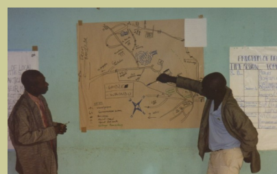
Mapping out communities and issues