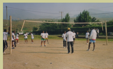
Raising awareness through sport