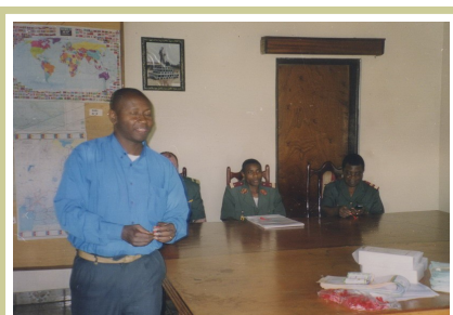
IDF staff talks with the military about HIV

After the presentation, the female military participated in the parade through Bamenda. This walk was an opportunity for the military to show the public that the military was combating HIV and AIDS. After the parade there was also a volleyball match.