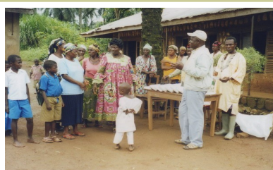
Distributing school items to OVCs

Description: In the framework of support to OVC, CARE Cameroon provided nutritional, educational and hygienic item support to children in Wum Central, Fungom and Mechum Valley sub divisions. IDF was the local based NGO that assisted with the delivery of the support.