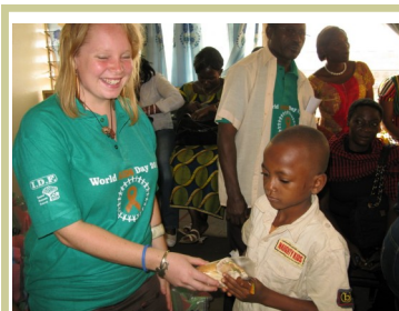
VSO volunteer helping to distribute baskets in 2010