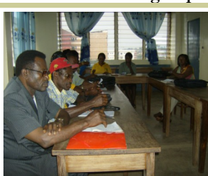
Monthly CV meeting at IDF

IDF uses CVs to carry out a lot of its home based care and orphans and vulnerable children program. VSO provides support for capacity building with these CVs. With VSO support, IDF has been able to empower its CVs in areas such as malaria, prevention of mother to child transmission of HIV, proper nutrition, and drug adherence. CVs attend monthly meetings which include a capacity building component.