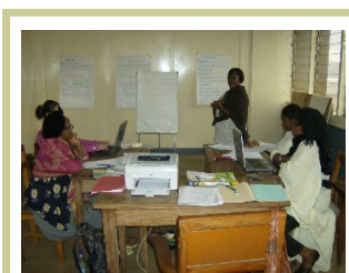
Elaborating IDF's Gender Policy

In 2010 one of VSO's focuses was mainstreaming gender. It carried out a gender sensitivity training workshop with all of its partners including IDF. As a result of this training IDF decided to mainstream gender sensitivity into its work by elaborating and implementing a gender policy and updating its existing policies to be gender sensitive. This policy was implemented in July 2010.