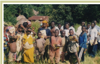
Awareness campaign in Furu Awa

Participants of the awareness campaigns and training sessions expressed satisfaction with IDF's work. Participants identified the following impacts: less stigma, more self-esteem, they have hope, they learned about HIV and AIDS.