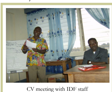
CV meeting with IDF staff

Activities: Under the new HBC program the following activities were carried out by CVs: