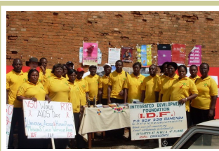
IDF on World AIDS Day 2009

Description: Since 1 st December 2001 IDF has been participating actively in World AIDS Day activities in collaboration with the Regional Technical Group (RTG) and the co-sponsorship of VSO. IDF usually organized activities to promote awareness about HIV and AIDS as well as activities to support people living with HIV and AIDS.